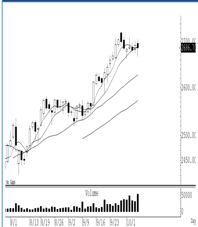
GOZ24 (Close 2,691.90 Chg 10.30)

ราคาทองคำโลกแกว่งออกด้านข้าง ทิศทางยังไม่ชัดเจน เราแนะนำยกการ์ดสูงหรือตั้ง stop ไว้ จากความผันผวนของราคาที่เราคาดว่าจะแกว่งแรง แนะนำ trading ในกรอบ 2,695-2,650 ดอลลาร์ รับรู้กำไร ปิดต่ำกว่าระดับ 2,650 ดอลลาร์ แนะนำ ถือ short เพื่อหวังผลปรับตัวลงแถว ๆ 2,600 ดอลลาร์ รับรู้กำไร เรากำหนดจุด stop สำหรับข้าง short ไว้ที่ 2,710 ดอลลาร์